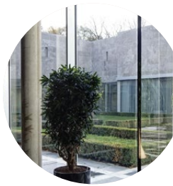
Tilburg University Founded 1927; > 20,000 students